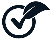
Consistent Product Quality